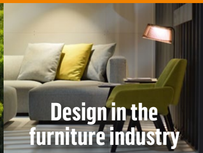
Design in the furniture industry