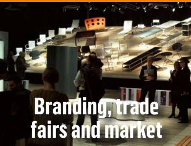
Branding, trade fairs and market