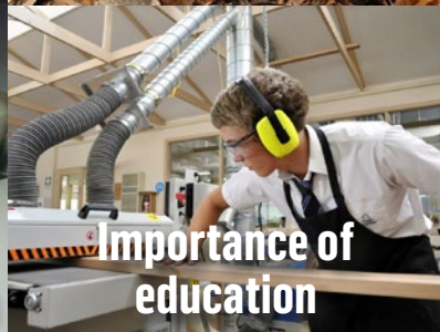
Importance of education

Aim of the Conference is to present, to the professional public, the latest trends on the sector scene, gather all the relevant sector actors in one place and initiate new changes in wood-processing and furniture production in Republic of Croatia and other countries in the region.