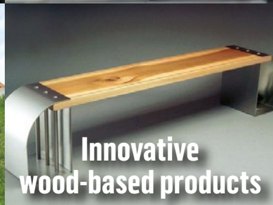
Innovative wood-based products