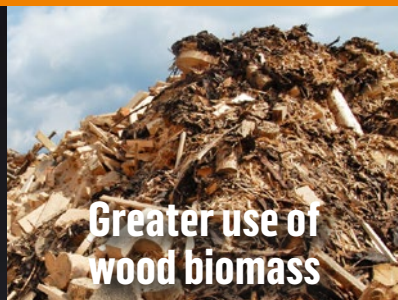
Greater use of wood biomass